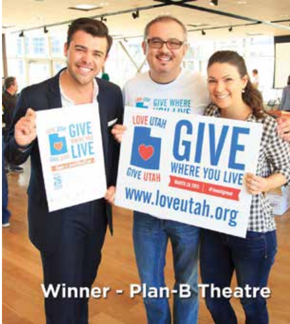
Winner - Plan-B Theatre

Clearlink provided training for nonprofits on how to refresh their websites and increase SEO. They also helped create a new look for Love UT Give UT and awarded additional prizes to nonprofits.